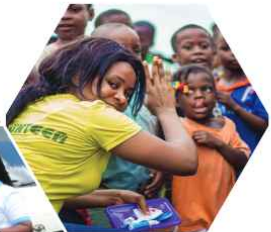
Top Marine staff visiting a childrens home