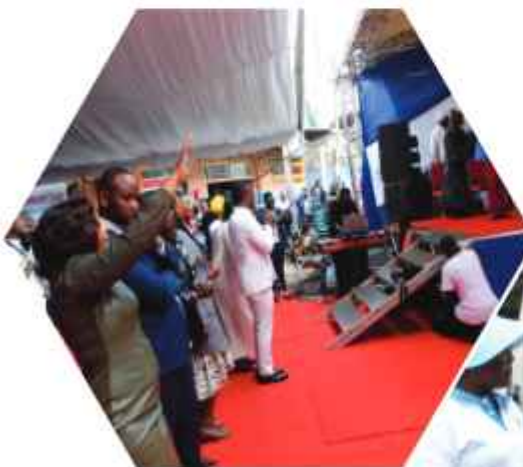
Top Marine staff helping to serve water during a prayer meeting for business community